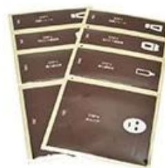
Conjoined bag ▶