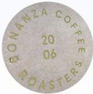
Gold Foil Stamping