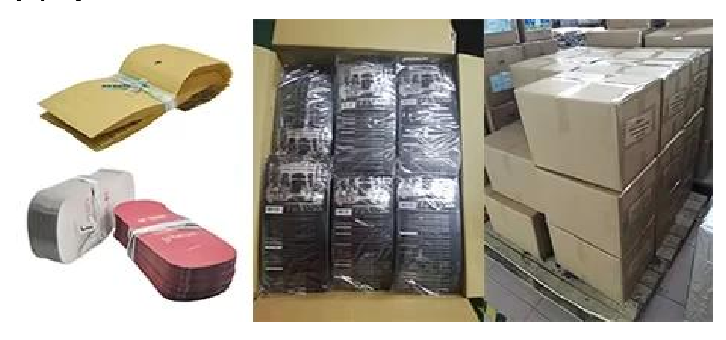
Delivery Below is the suggestion for shipping method: 0.5kg - 120 kg, ship by express from door to door 120kg - 400kg, ship by air, pick up at air port above 400kg, ship by sea, pick up at sea port We can also ship as you required.

About 50pcs or 100pcs in one bundle/one opp bag (depends on bag size), then put in a poly bag, and then one thick carton.