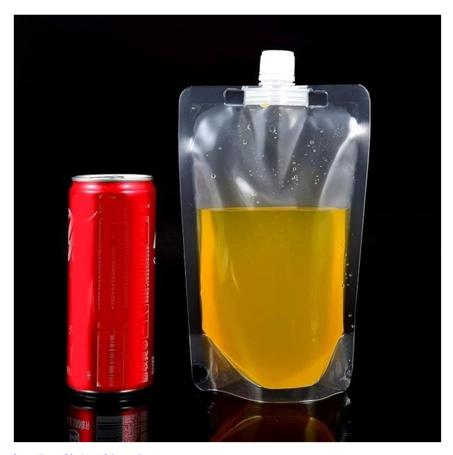
http://Reusable Liquid Spout Bags