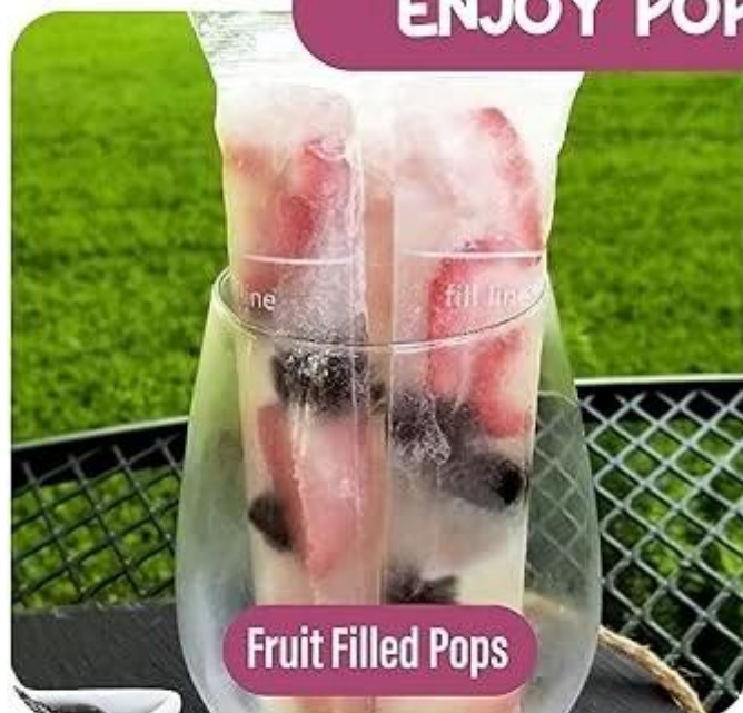
Fruit Filled Pops