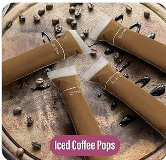
Iced Coffee Pops