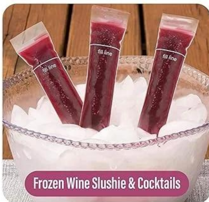
Frozen Wine Slushie & Cocktails