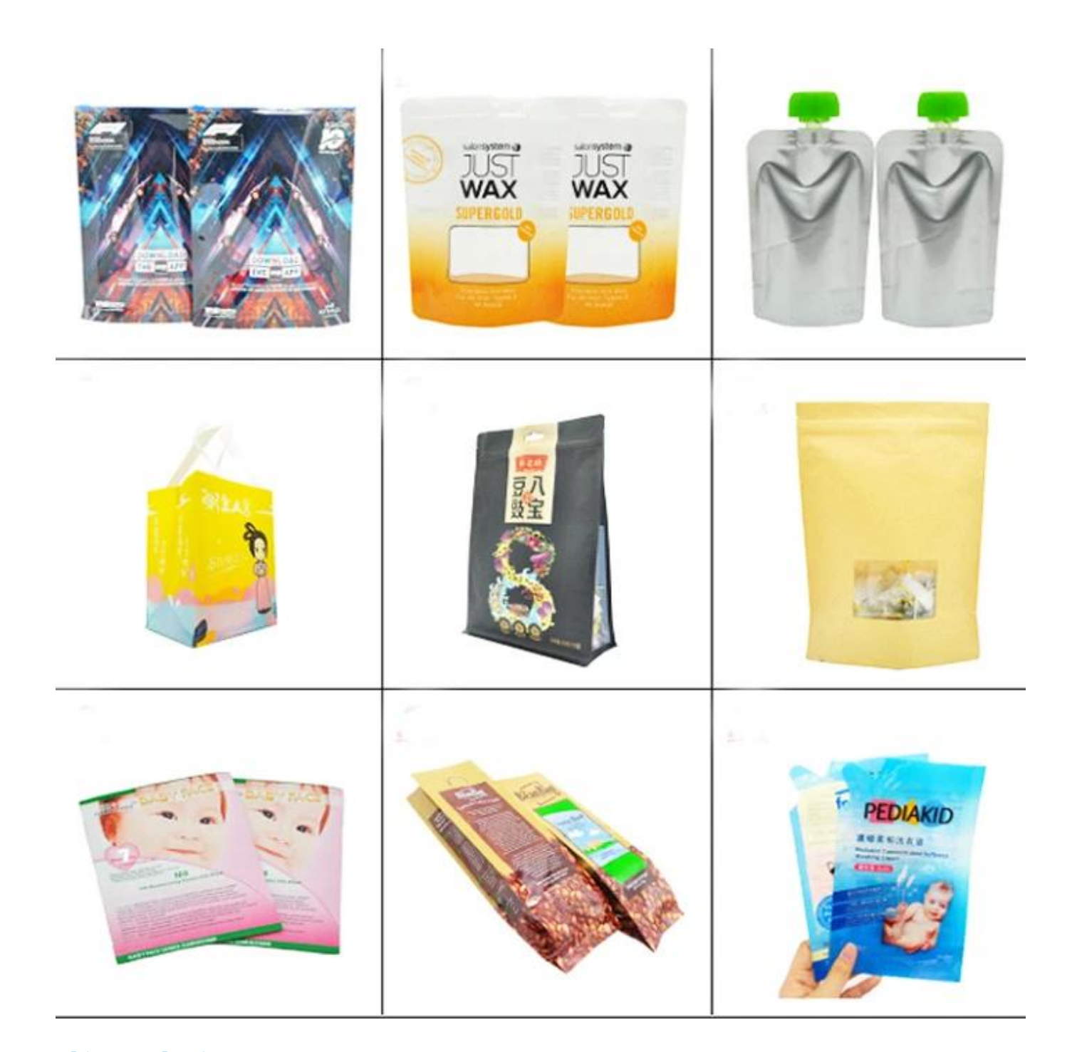
China Packaging Bags Factory