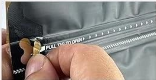
1. Tear open the zipper on the bag