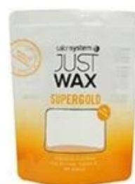
Stand up zipper bag ▶