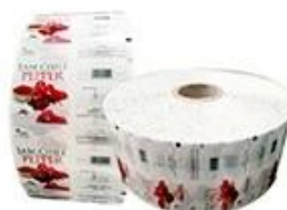
Roll film ▶