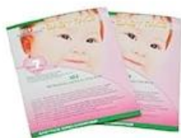
3 sides seal bag ▶