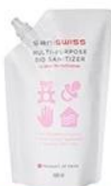
Stand up bag with spout ▶