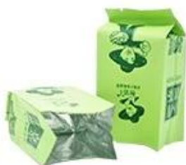
Tea bag ▶