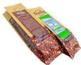
Side gusset bag ▶