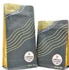
Flat bottom side gusset bag ▶