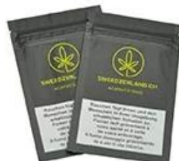
Zipper bag ▶