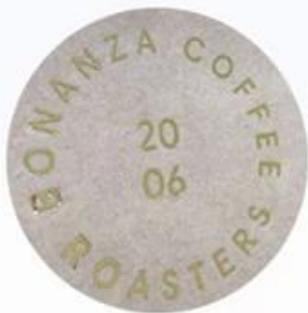
Gold Foil Stamping