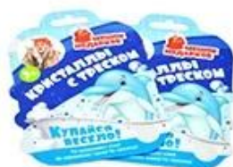
Special shape bag ▶