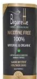
Tobacco bag ▶