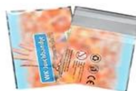
Self adhesive bag ▶