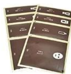
Conjoined bag ▶