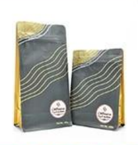
Flat bottom side gusset bag