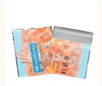
Self adhesive bag 🕦