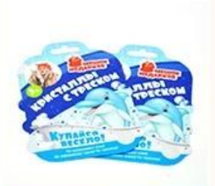
Special shape bag 🕥