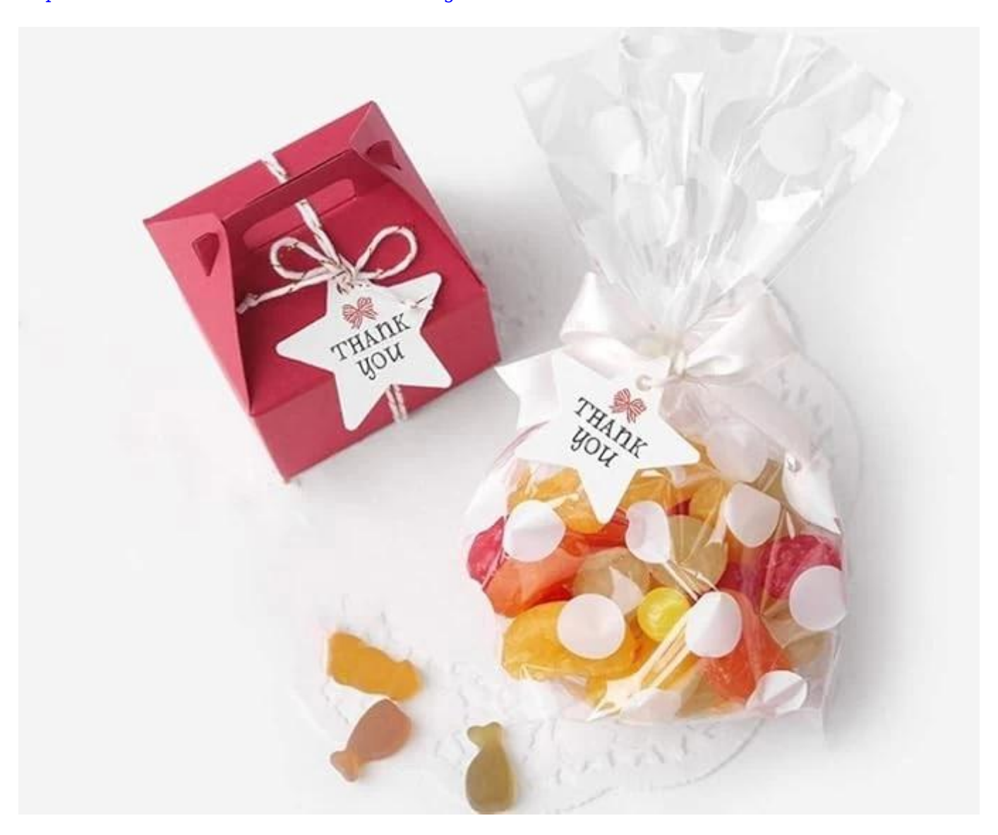
http://Bottom Gusset Clear Plastic Cookie Bags