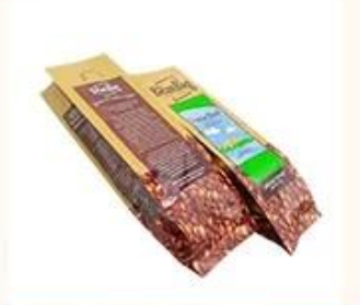
Side gusset bag 🕟