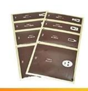
Conjoined bag 🕟