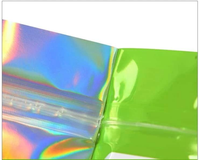
Resealable Strong Ziplock