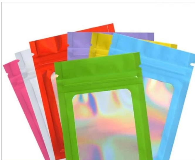
Colorful Compound Material