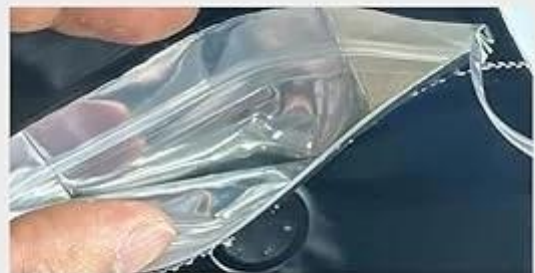
2. Open the inner sealing zipper