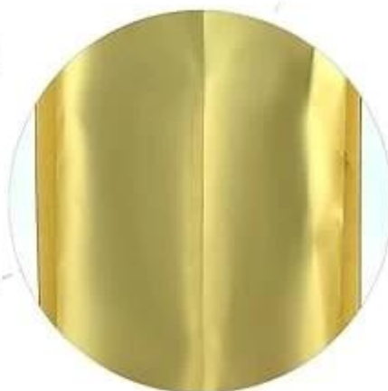
Side Metal Gold Color