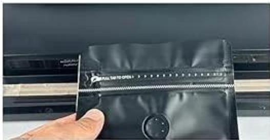
3. Find the sealing position