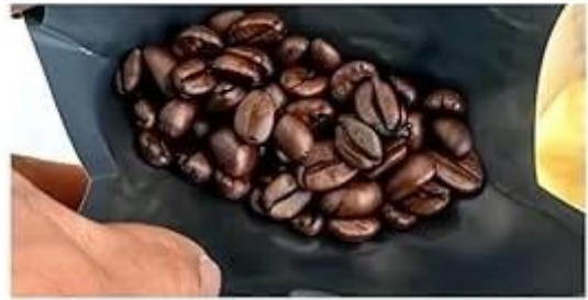
2 Put in coffee beans