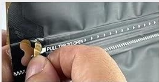
1. Tear open the zipper on the bag