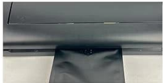
4 Heat sealed bags