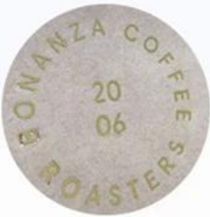
Gold Foil Stamping