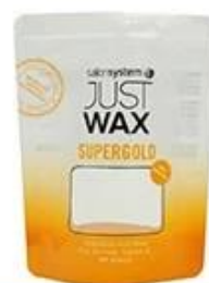
Stand up zipper bag ▶